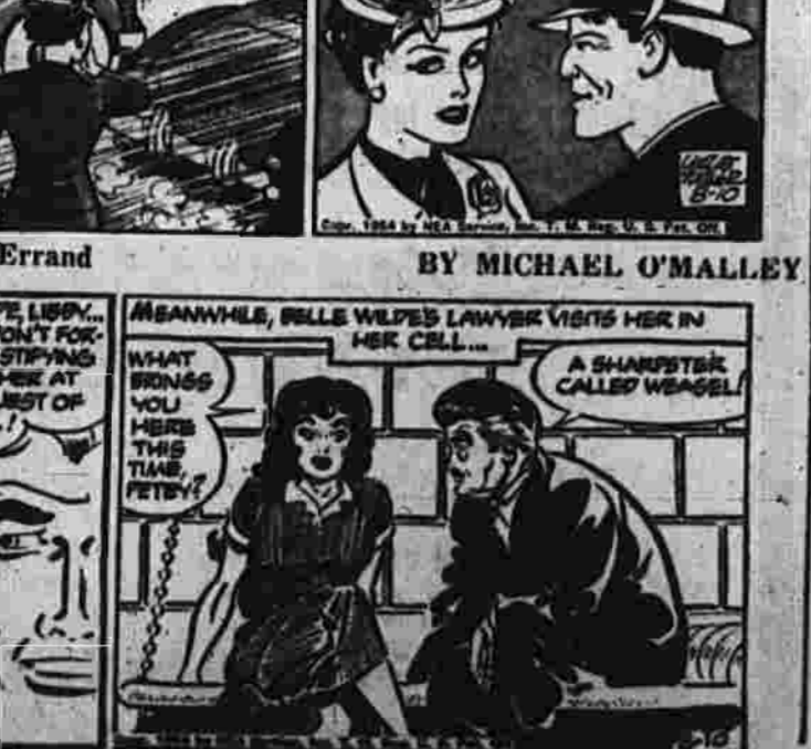
Stranger in Paradise